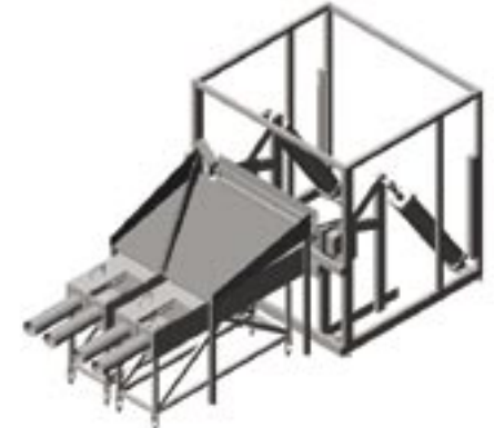
Hoist feeding two stuffers, exiting to the front.

Custom hoppers can be designed to tip onto any machine or work surface.