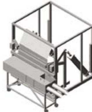
Hoist feeding stuffer exiting to the right.