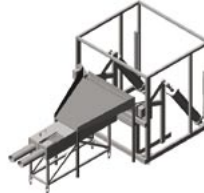
Hoist feeding one stuffer, exiting to the front.